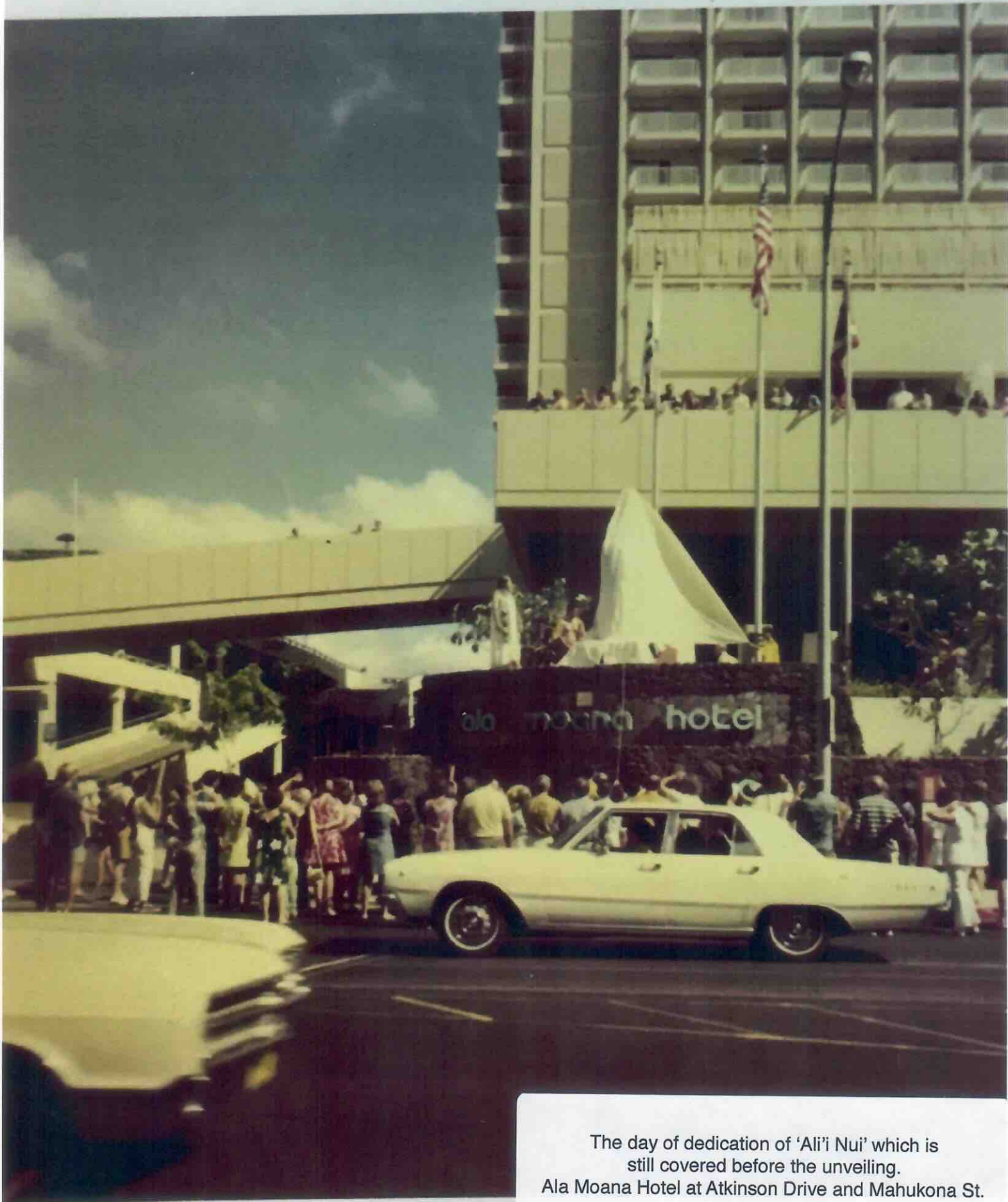
The day of dedication of 'Ali'i Nui' which is still covered before the unveiling. Ala Moana Hotel at Atkinson Drive and Mahukona St. August 28, 1971