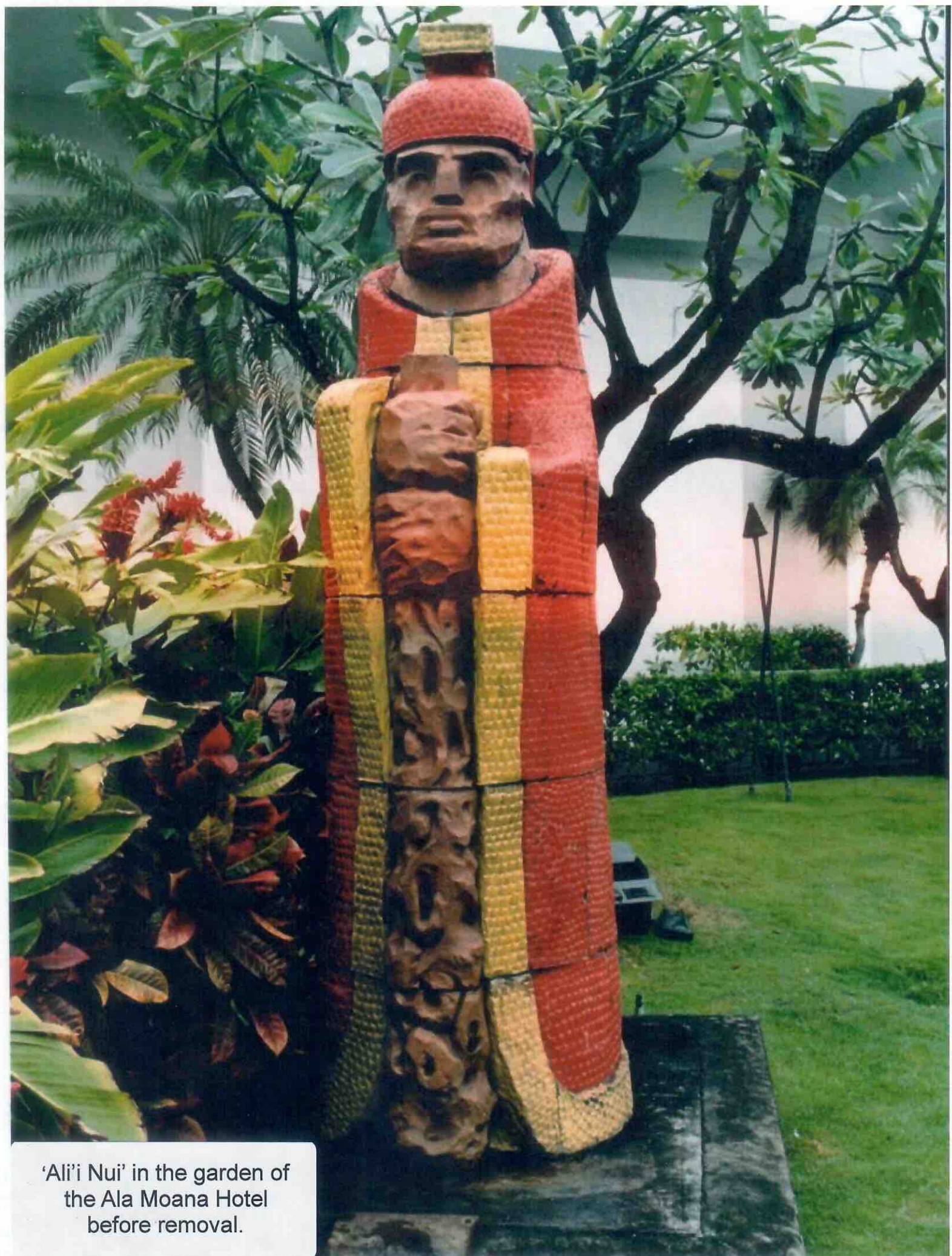
'Ali'i Nui' in the garden of the Ala Moana Hotel before removal.