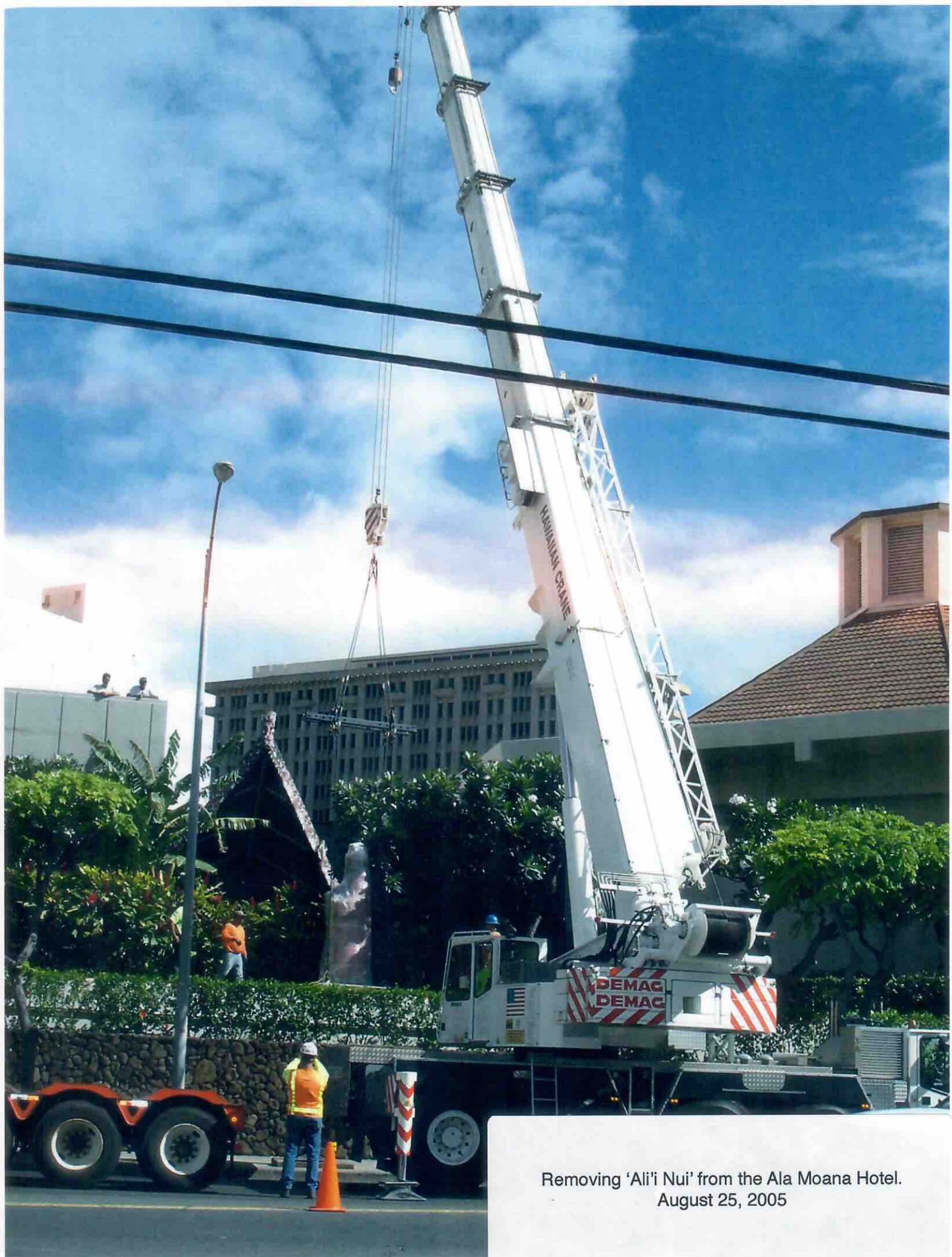
Removing 'Ali'i Nui' from the Ala Moana Hotel. August 25, 2005